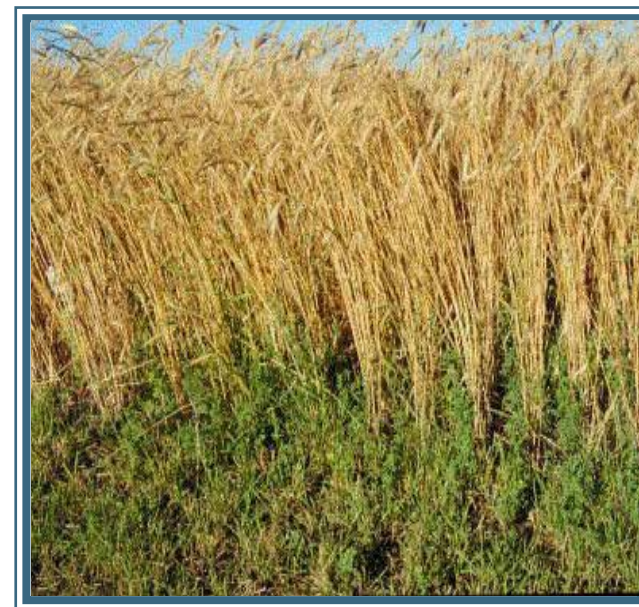
Lucerne intercropped with rye in Canada